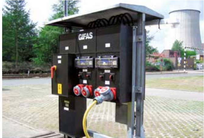
Wall mounted distributor