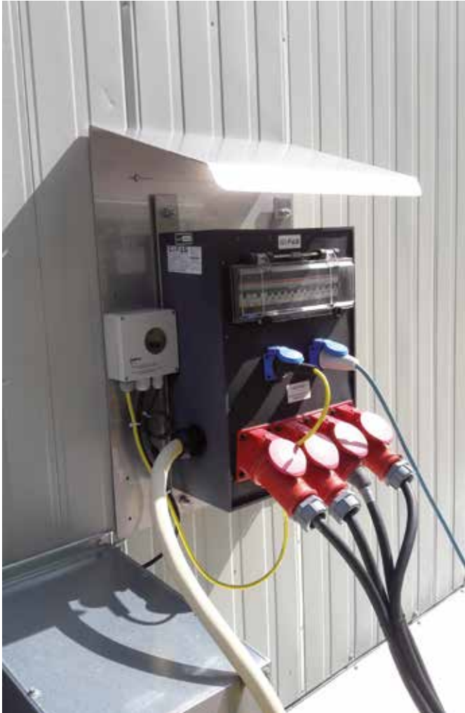
Wall mounted distributor

Use cases based on wall mounted distributors / mobile distributors / energy columns