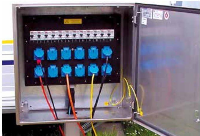
Wall mounted distributor